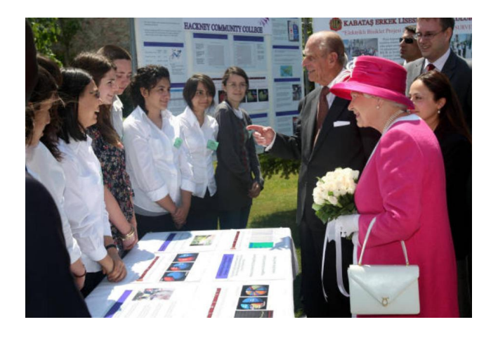
Istanbul Kabatas Highschool